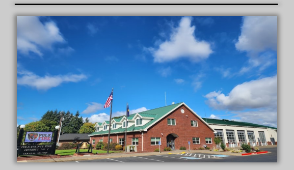
INDEPENDENCE/MONMOUTH CENTRAL STATION-STATION 90